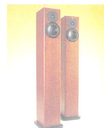
Totem Arro £1200 ★★★★★

Type Floorstander • Sensitivity (dB/w/m) 85 • Impedance (ohms) 8 • Max power handling 150W • Biwirable No • Finishes 4 • Dimensions (hwd) 79 x 17 x 25cm