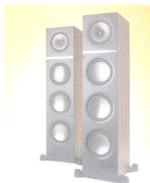
KEF Q700 £1000 ★★★★★

Type Floorstander • Sensitivity (dB/w/m) 89 • Impedance (ohms) 8 • Max power handling 150W • Biwirable Yes • Finishes 3 • Dimensions (hwd) 92 x 21 x 30cm