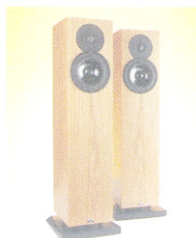
Kudos X2 £1350 ★★★★★

Type Floorstander • Sensitivity (dB/w/m) 89 • Impedance (ohms) 8 • Max power handling 150W • Biwirable Yes • Finishes 3 • Dimensions (hwd) 92 x 21 x 30cm