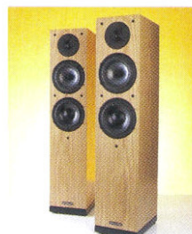
Spendor A5 £1500 ★★★★★

Type Floorstander • Sensitivity (dB/w/m) 86 • Impedance (ohms) 8 • Max power handling 150W • Biwirable No • Finishes 6 • Dimensions (hwd) 78 x 17 x 21cm