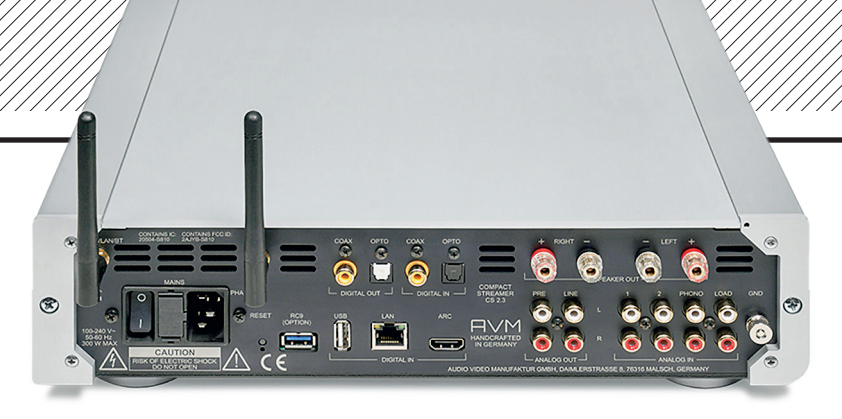
ABOVE: Two analogue line ins are joined by MM/MC phono (custom loading via adjacent RCAs) and digital in on wired/wireless LAN, BT, HDMI (ARC) and USB-A (for HDD connection). Digital in/out is available via coax/optical alongside fixed/variable preamp outs (RCAs) and a pair of 4mm speaker cable binding posts

that gets into the heart of whatever you choose to play, presenting this excellent recording with crispness and control, and allowing the listener to appreciate the quality of the musicianship on offer.