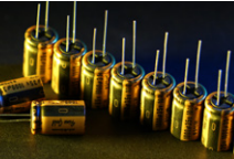
Nichicon FW capacitors