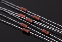
DALE military resistors